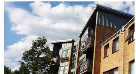
03. Detail of butterfly roof to apartments