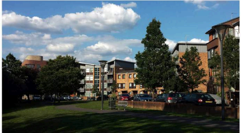
01. Photograph of Johnson Rd showing the crescent of houses and apartments facing the canal