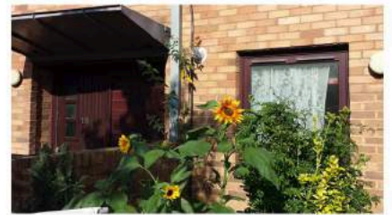
07. Johnson Road front garden