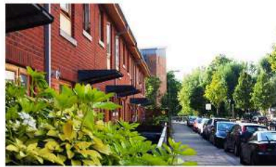
06. Lawrence Avenue front gardens