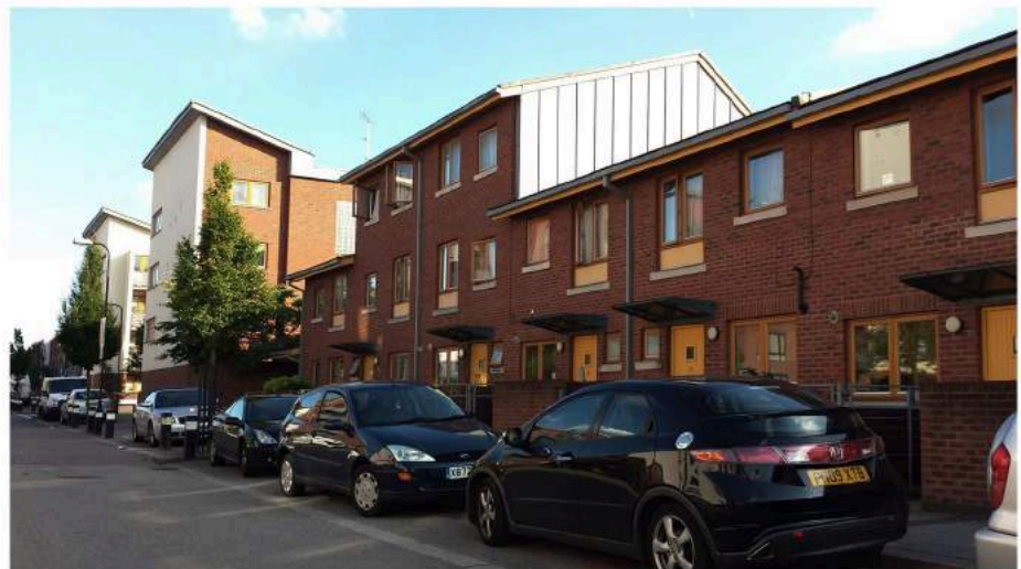
04. Terrace of townhouses on Lawrence Avenue