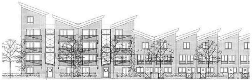
05. Flattened elevation of the crescent (preliminary proposal)

Phase 1 was completed in 2000 and delivered 380 new dwellings. Phase II was completed in 2003, and phases III and IV will deliver an additional 400 new homes