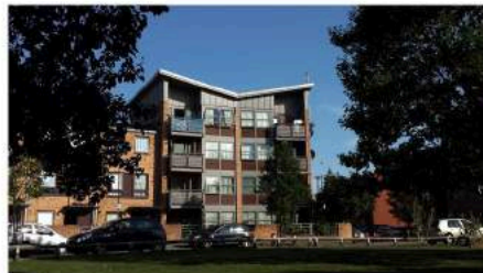
02. End block of apartments, Johnson Rd