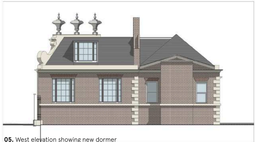
05. West elevation showing new dormer

The additional accommodation includes a new staircase, two bedrooms, 2 bathrooms and built-in storage at first floor (roof) level. External stucco render and reconstituted stone detailing will be repaired to ensure the new details match the existing.