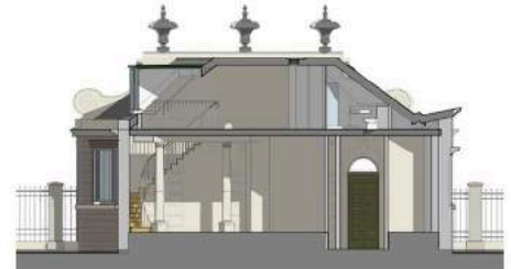
03. Section showing extension and dormer