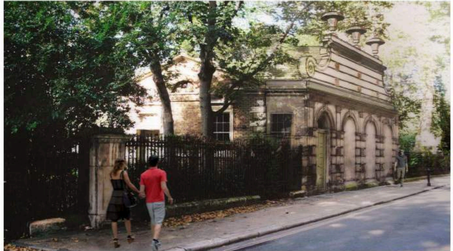
01. cgi photomontage view 1 : front facade from Fair St. showing classical detailing to extension