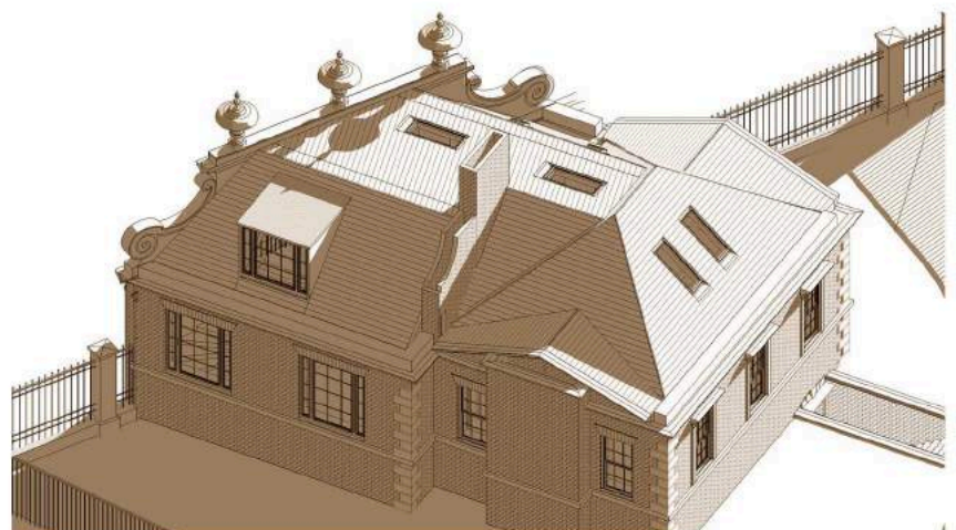
06. Birdseye view from the park showing new dormer window and conservation skylights