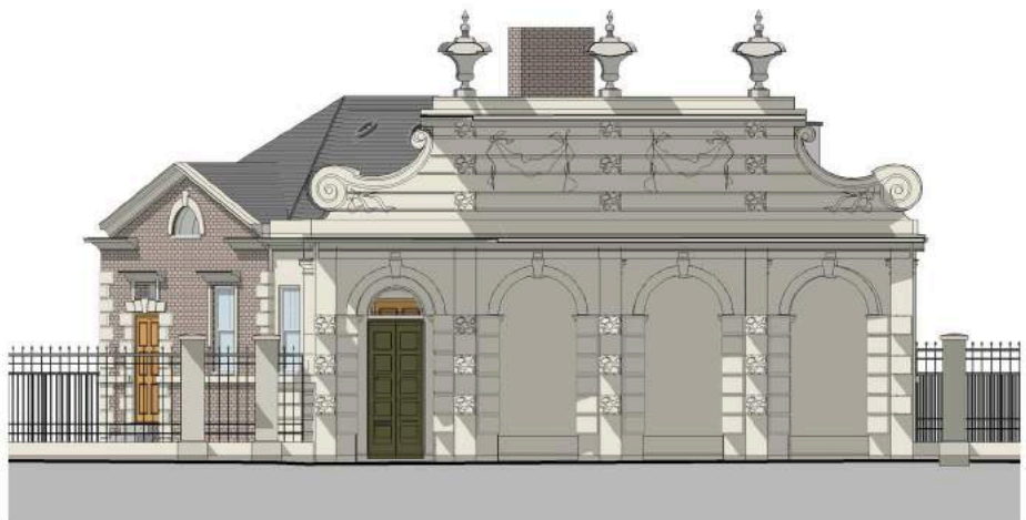
04. Elevation facing Fair Street