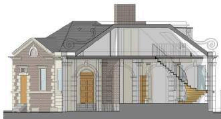
02. Section showing new staircase