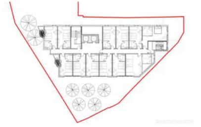
07. Typical rooms layout