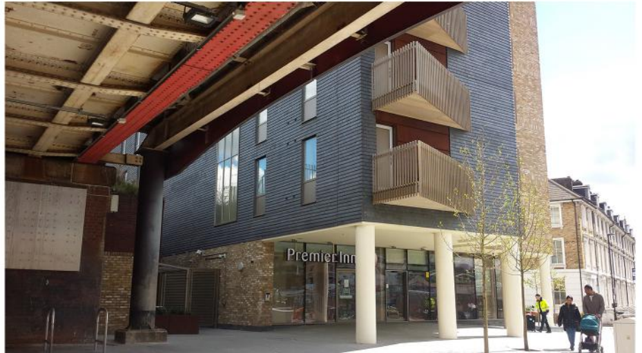
01. Photograph of the entrance to the hotel from under the railway bridge