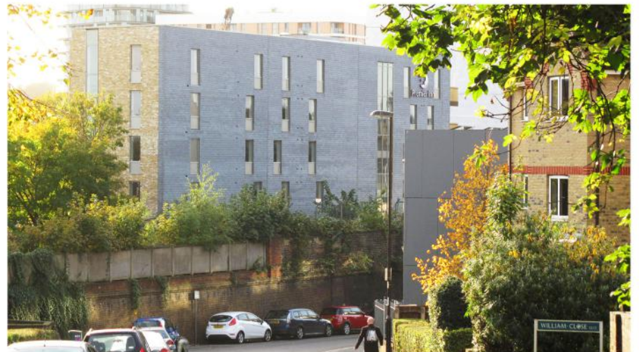
04. Rear view from Granville Park