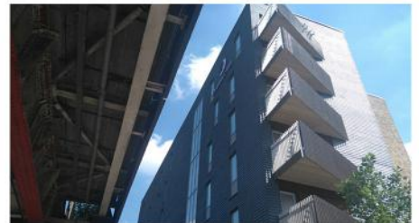
03. The balconies from pavement level