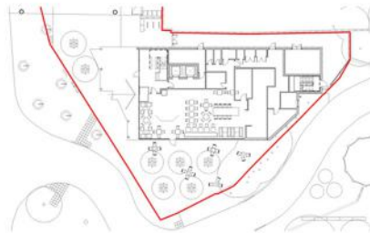
06. Ground floor layout