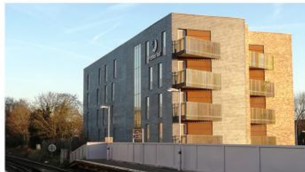
02. View of the hotel from railway platform