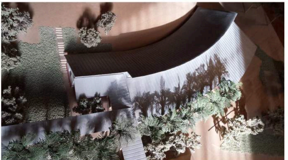
04. Photo of the model showing curved layout