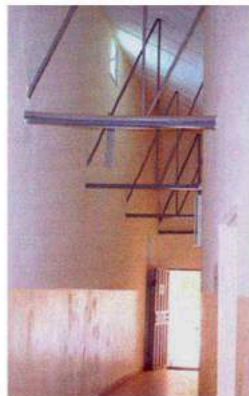
06. Photo: central corridor