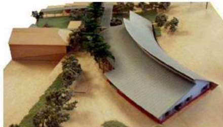
02. Photo of the model