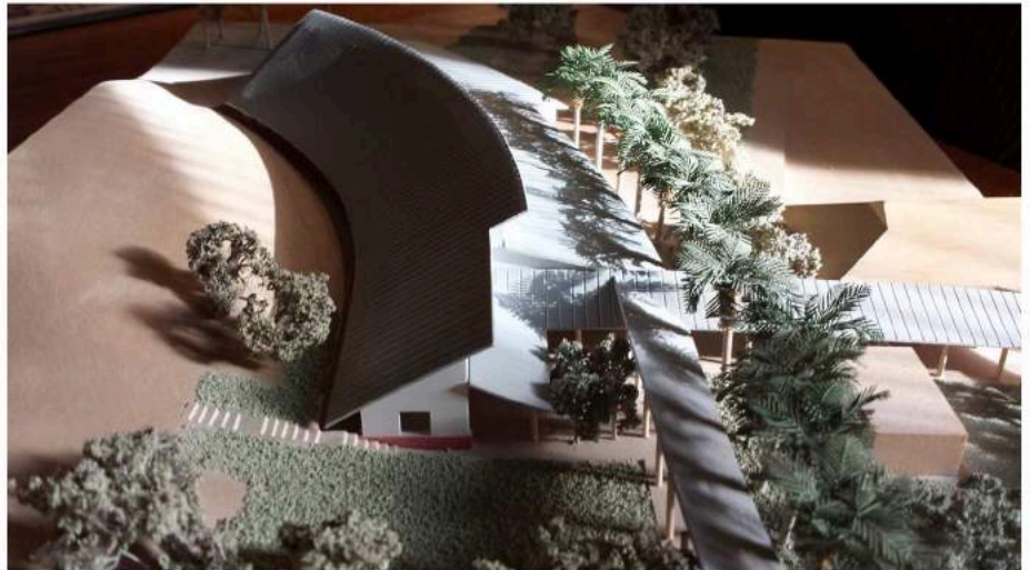
01. Photograph of the model showing entrance to Prosthetics Centre