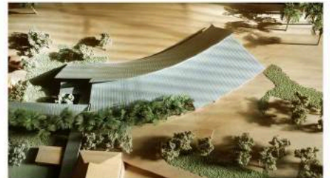
03. Photo of the model