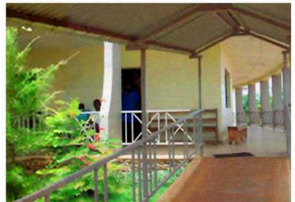
07. Photo: main entrance and external shaded walkways