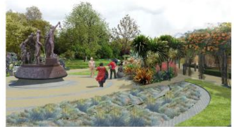
03. cgi view 3: Sculpture from South