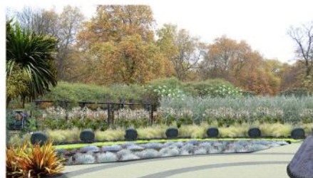
02. cgi view 2: Cannon balls along coast