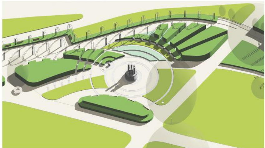
05. 3d view of Enslaved Africans Memorial Garden, looking South

Key dates leading to the abolition of slavery will be carved into paving slabs, and further symbolism is provided by stone balls and chain representing the terrible trans-Atlantic crossings known as the 'Middle Passage'. The garden will be a place for quiet contemplation and education and will be accessible to all.