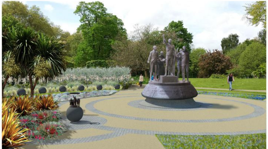
01. cgi view 1: Approach to sculpture from East