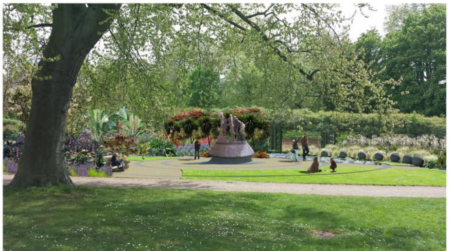
04. cgi view of memorial garden approaching from West