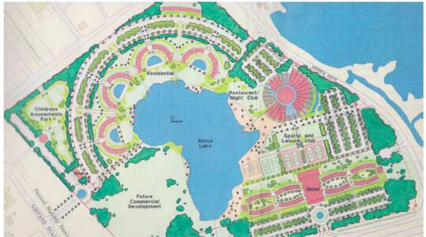
05. The Masterplan

Other elements of the scheme included 4 apartment buildings, each crescent providing 62 apartments, Children's Amusement Park, Restaurant/Night Club, Several retail units, and space for future commercial development