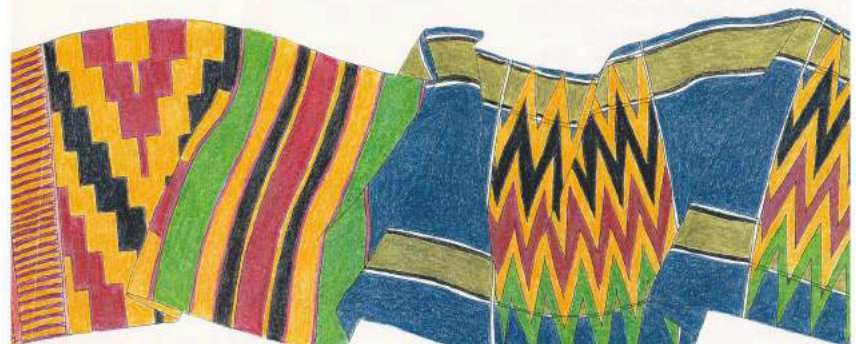
10. The project logo