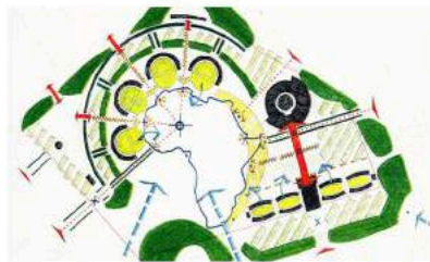
06. Concept diagram