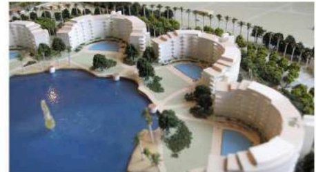
03. Apartment crescents facing fountain