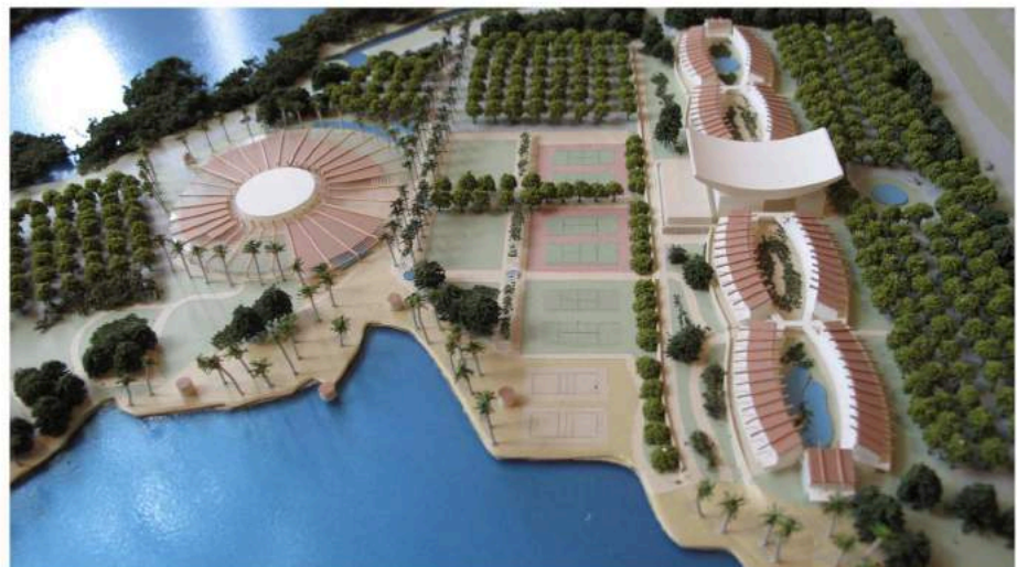
04. Hotel and Sports and Leisure Centre