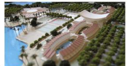
09. The hotel