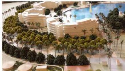
02. Shaded parking for residents