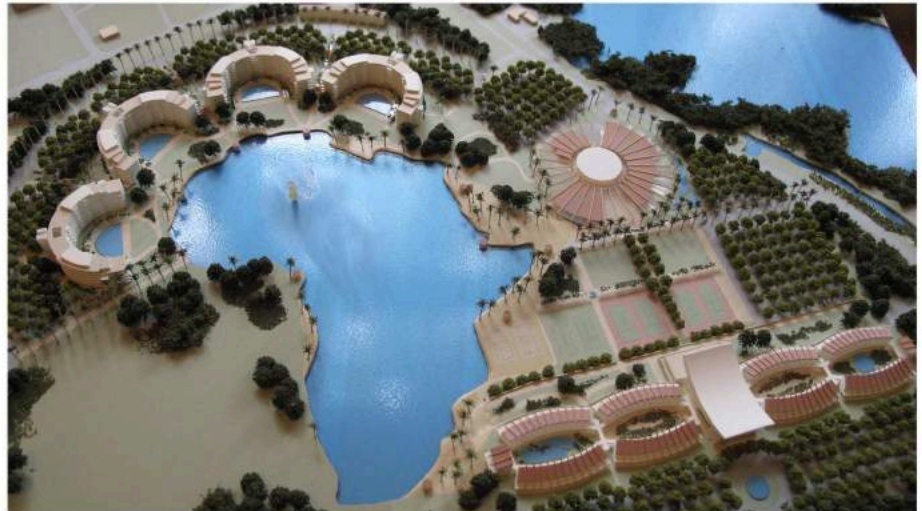
01. Remodelled lagoon in shape of Africa with Apartments, Hotel and Sports Centre