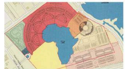
07. Zoning diagram